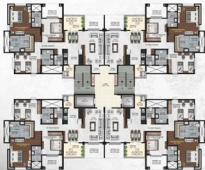
CONSIDERABLE AREA STATEMENT