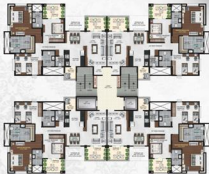
CONSIDERABLE AREA STATEMENT