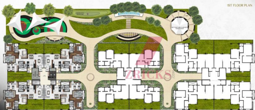
D1 - BUILDING